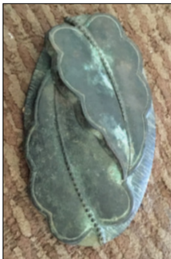
Finder: Dan B., Maine Using: ACE 400 Find: Brooch from the late 1850s