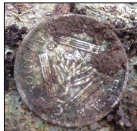
Finder: Harvey J., Europe Using: ACE 300i Find: South African silver 3 pence coin