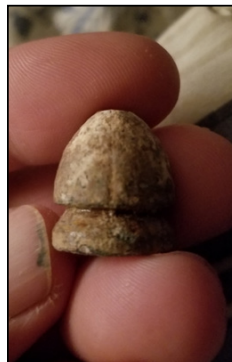
Finder: James R., Tennessee Using: ACE 250 Find: Rare Civil War Confederate 69 cal. Nessler variant bullet