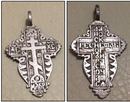
Finder: Eni D., Europe Using: ACE 250 Find: Russian Empire silver cross