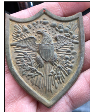
Finder: Nicholas G., New York Using: AT Pro Find: Civil War-era broad eagle insignia plate