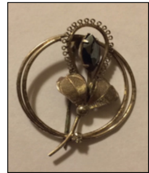
Finder: Bob D., Canada Using: ACE 300i Find: This silver brooch was under two inches of soil near a barbecue pit.