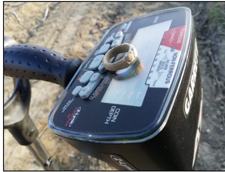
Finder: Rene S., Europe Using: AT Max International Find: Roman ring