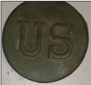
Finder: James H., Alabama Using: AT Pro Find: Civil War U.S. rosette