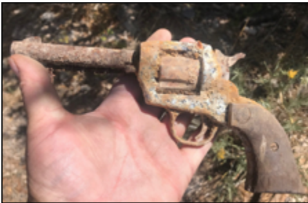
Finder: Robert G., Using: AT Pro Find: Savage model 101 hand gun, circa 1960s