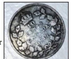
Finder: Shawn W., Canada Using: AT Pro Find: 1919 silver Canadian dime