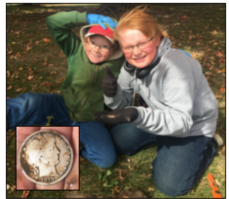
Finder: Jake C., Illinois Using: ACE 300 Find: 1915 silver Barber half dollar