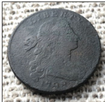
Finder: Nick P., New York Using: ACE 300 Find: 1798 Draped Bust large cent