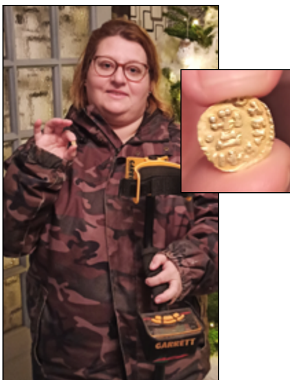
Finder: Angélique G., Europe Using: ACE 250 Find: Merovingian gold coin