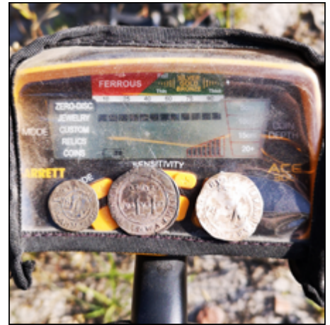
Finder: Mario M., Mexico Using: ACE 300i Find: Three silver reale coins