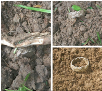
Finder: Missi P., Ohio Using: ACE 400 Find: Sterling silver Celtic friendship ring