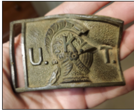
Finder: Kim C., Texas Using: AT Pro Find: U.K.T. brass buckle