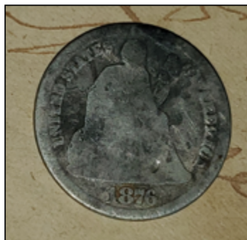
Finder: Brandon W., Alabama Using: AT Pro Find: 1876 Carson City Seated dime