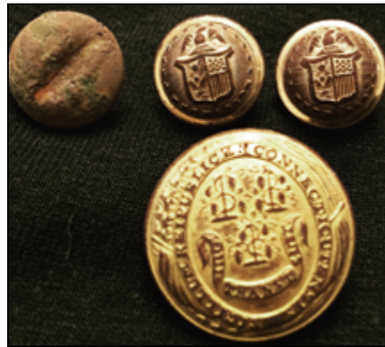
Finder: Brian W., Virginia Using: AT Pro Find: Four Civil War buttons: a general service, two New York cuff buttons, and a stunning Connecticut state seal button