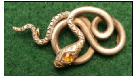
Finder: Danny W., Massachusetts Using: AT Pro Find: Victorian era gold snake brooch