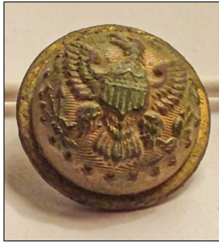
Finder: Janine D., Michigan Using: AT Pro Find: Civil War general staff button